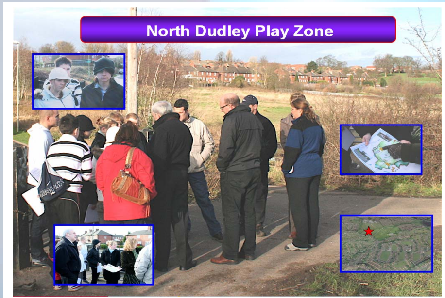
The Children's Play Initiative Prioritisation Panel visiting project locations.